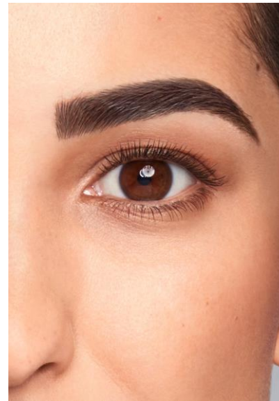
Full Brow Technique

For more information watch our instruction video.