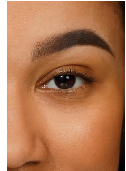
Brow Filling Technique