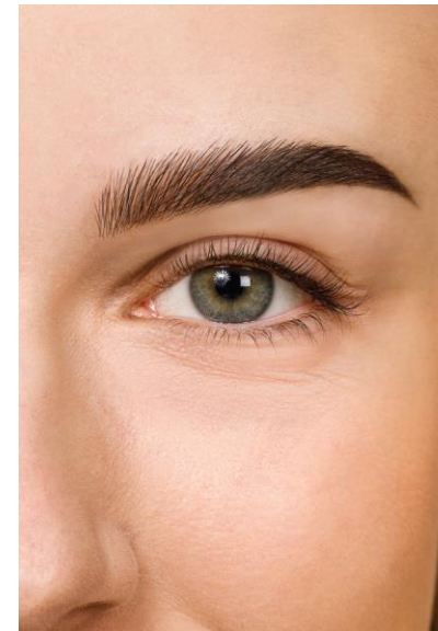
Ombre Shading Technique